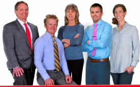
The Boulder Property Network